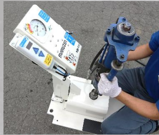
Pile Driver KH192