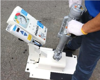
Handheld Breaker BH23K